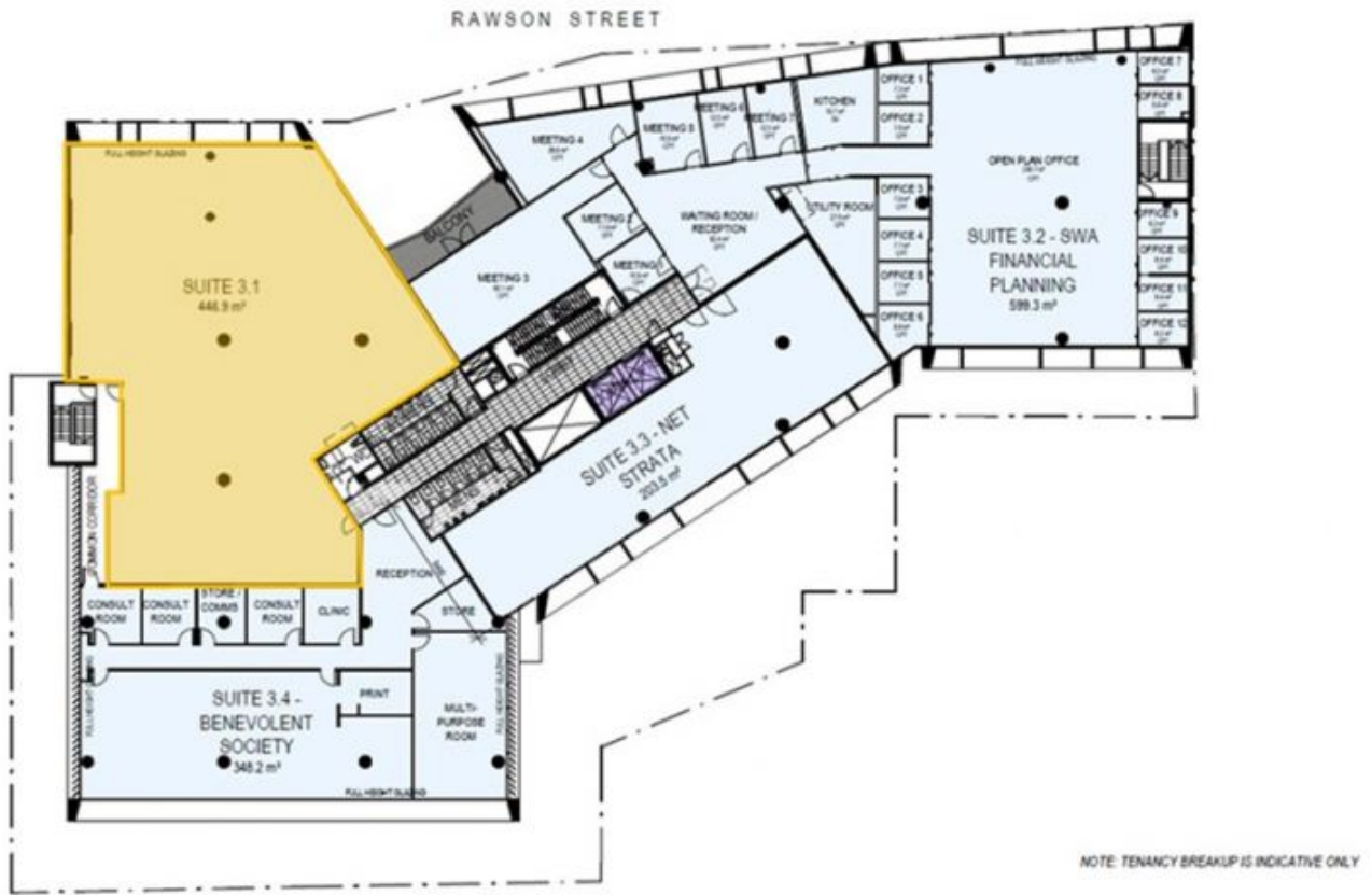
FLOOR PLAN - LEVEL 03 - COMMERCIAL